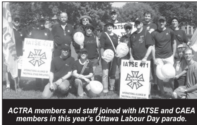
ACTRA members and staff joined with IATSE and CAEA members in this year's Ottawa Labour Day parade.

for speciality TV channels and expanding that model to conventional broadcasters;